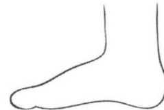
INSIDE OF FOOT

HOW LONG AGO DID THIS PROBLEM FIRST START? _____ DAYS/ WEEKS / MONTHS/ YEARS