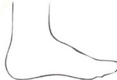
OUTSIDE OF FOOT